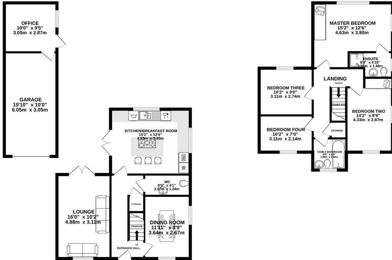
TOTAL FLOOR AREA : 1505 sq.ft. (139.8 sq.m.) approx.

Whilst every attempt has been made to ensure the accuracy of the floorplan contained here, measurements of doors, windows, rooms and any other items are approximate and no responsibility is taken for any error, omission or mis-statement. This plan is for illustrative purposes only and should be used as such by any prospective purchaser. The services, systems and appliances shown have not been tested and no guarantee as to their operability or efficiency can be given. Made with Metropix ©2026